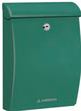
Green/ E-5333 * 153338