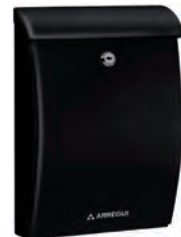
Black/ E-5334 * 153345