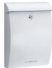
White/ E-5331 * 153314